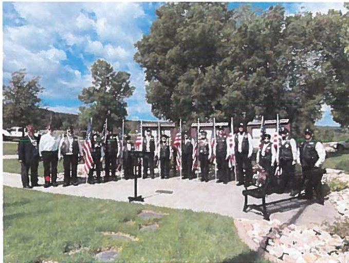
Second from the left in white